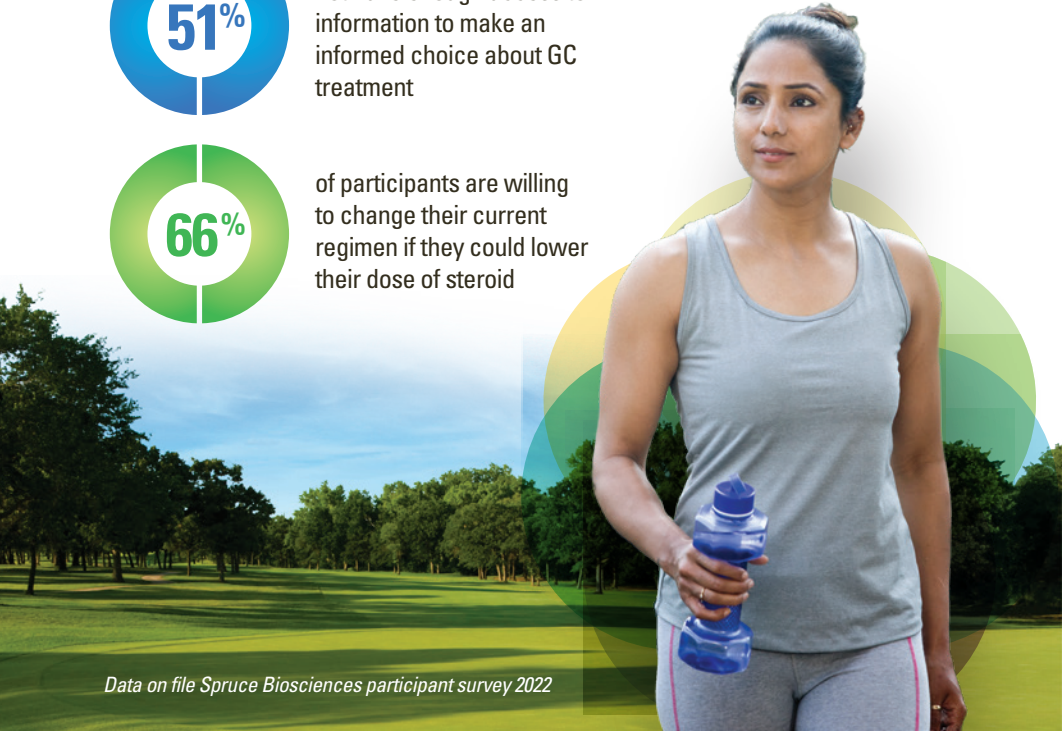
Data on file Spruce Biosciences participant survey 2022