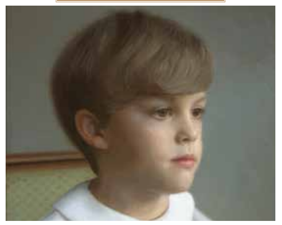
WHO WILL PAINT YOUR PORTRAIT?

Portraits, Inc. represents over 100 of the world's finest portrait artists offering a range of styles and prices.